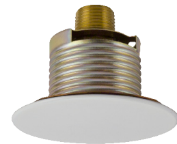
84mm (3 5/16") diameter plate